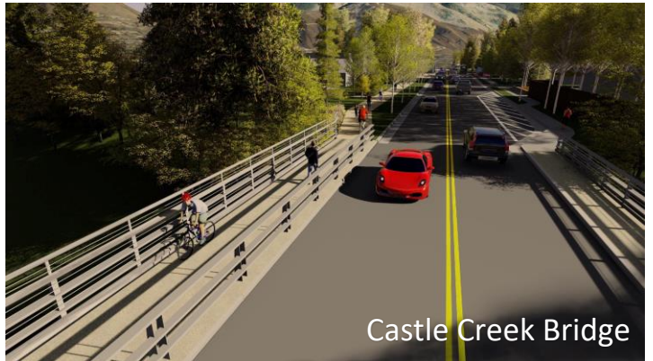
Castle Creek Bridge