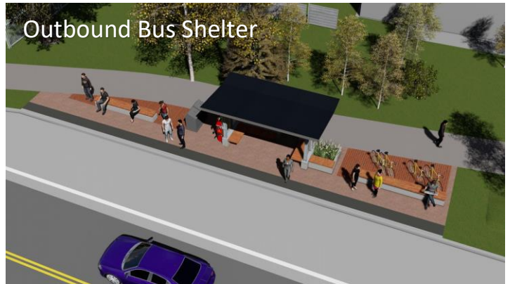
Outbound Bus Shelter