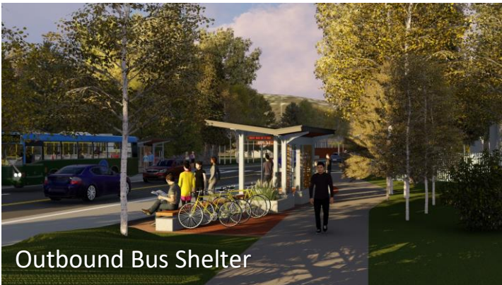
Outbound Bus Shelter